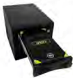
External Desktop USB 3.0 Docking Station (Available Now)

RHD Can Be Used With Docking Bay, Tower, or 19" Rack