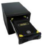
External Desktop USB 3.0 Docking Station (Available Now)